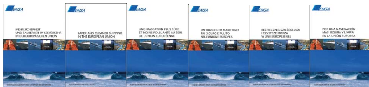
The EMSA brochure was printed in 20 languages and can be seen on the website

Also targeting the same groups are the Agency's media related activities. These involve the set up of media interviews and meetings, the generation and distribution of press releases and, when appropriate, the supply of information for articles published in the press. There was a significant increase in media interest in the work of EMSA during 2006, due largely to the maturing of existing assessment and inspection tasks and to the development of new operational tasks. This interest is expected to continue during 2007.