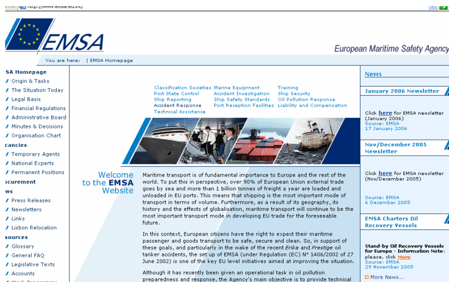
The homepage on the EMSA website

EMSA's most important information and communication tool, the website, falls into this category. It is the primary source of information on its activities for all stakeholders and is a widely accessed site. It is fundamental that it contains all the necessary information for stakeholders and that it enables them to get where they want to go quickly. At the beginning of 2007, an average of around 10,000 page views per day were recorded, and this is rising. Both the website and intranet are in a continuous process of improvement and updating, and the appearance of the website will be modified in early 2007, prior to a significant overhaul once the new CMS is operational. It is intended that this will provide greater flexibility and efficiency in structuring, accessing and presenting the information on the site.