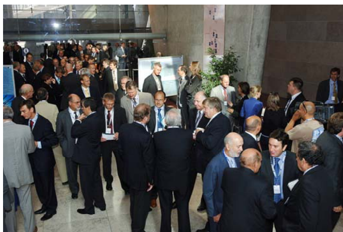
Stakeholders take a break at an EMSA event

The aim is to consolidate the efficient and effective integration of the EU institutions, Member State and international organisations, industry and other stakeholders into the EMSA network, so that the greatest possible benefit can be obtained from their interaction. From a communications perspective, this will be achieved by operating an extensive events programme in order to further improve the productive exchange of information and dissemination of best practice between EU Member States and other interested parties in the network.