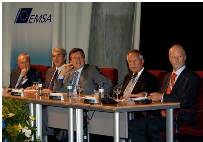
High level representatives at EMSA on Inauguration Day

Close behind are the Member State government maritime administrations and organisations, and it is vital that the Agency continues to have the best possible interpersonal relationships with these organisations, in order to achieve the desired developments and improvements in line with EU policy. EMSA has therefore established close ongoing relationships with the appropriate people in all of these organisations.