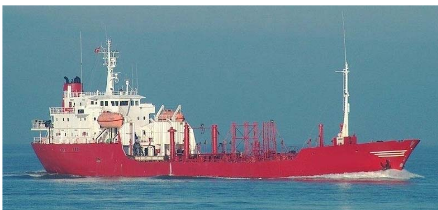
EMSA oil pollution response vessel Santa Maria

The CleanSeaNet leaflet will describe EMSA's work in detecting pollution by using low earth orbit satellites. Ships often discharge oil and other pollutants into the sea, either accidentally or deliberately, and satellite monitoring is an efficient and cost-effective way of detecting these events. The data from the satellites is downloaded to receiving stations, analysed, processed and sent to the most appropriate users. In cases where the pollution has not already been reported, the system gives Member States the information that they need to assess the situation in greater detail and, if necessary, to take action to identify and prosecute the polluters. This will be one of a series of pollution related publications which are released on a regular basis. For example, an update of the Inventory of EU Member States Oil Pollution Response Capacities will be published in 2007, as well as the first EU inventory of hazardous and noxious substance (HNS) emergency response capabilities . In addition, the Marine Pollution Response Assistance: Frequently Asked Questions publication was re-printed at the beginning of 2007 due to popular demand.