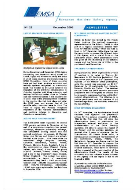
EMSA monthly newsletter

In addition to the previously mentioned publications, EMSA has a legal requirement to produce two key documents as part of the annual budgeting cycle. These are the work programme, which gives the outlook for the year ahead, and the annual report, which summarise the work done in the previous year. After adoption by the Administrative Board, these documents are submitted to the European Parliament, the Council, the Commission and the Member States. They are also published on the EMSA website and made available more widely to stakeholders in hard copy. The Work Programme 2007 and the Annual Report 2006 will be published in early 2007.