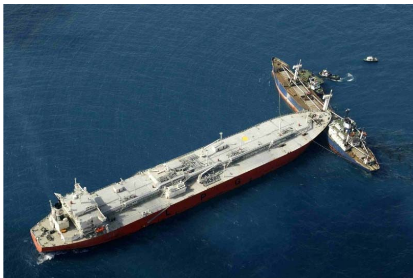
EMSA provides daily information on accidents

In order to ensure that EU level decision makers in EMSA and the European Commission can obtain timely notification and information should a maritime disaster occur, the Early Warning Alert Mechanism (EWAM) monitors international newswires and other key sources 365 days per year. In parallel, having been set up in 2006, a system for ensuring that the Agency is quickly notified of major actual or potential oil spills, and for notifying and mobilising its contracted oil pollution response vessels, is now fully operational.