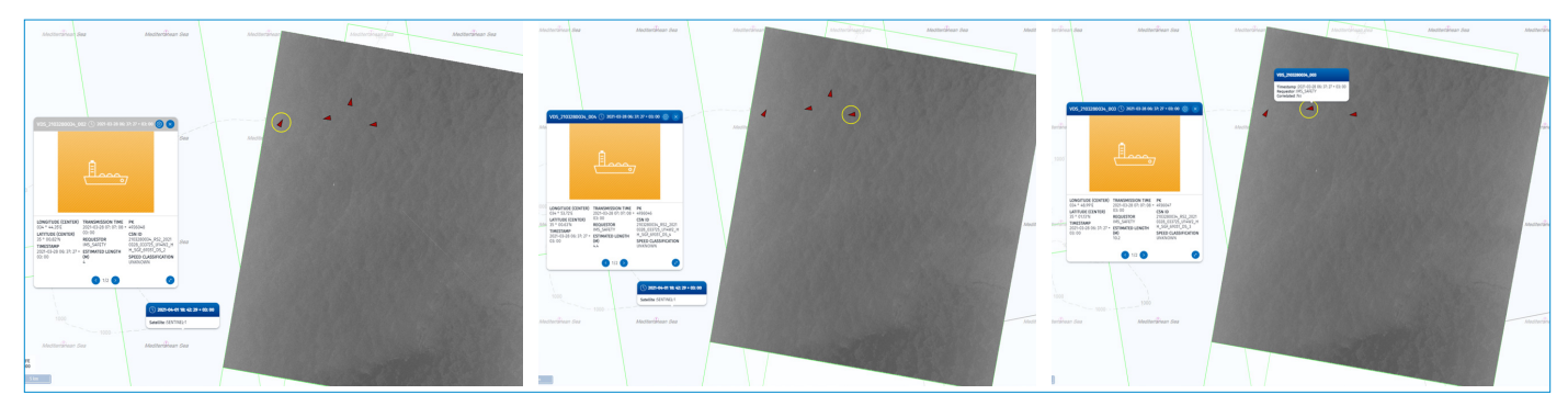
Earth Observation images and derived data help to detect dark vessels which are not transmitting their whereabouts

One of the dark vessels was detected in the morning of 1 April, off the Cyprus Eastern coast (Cape Greco) with 9 persons on board, all which were successfully rescued.