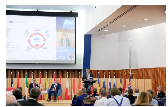
100 participants attended the event, held at EMSA's headquarters